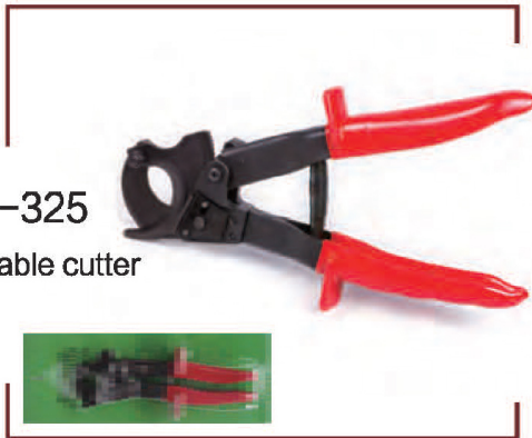
● CC-325 Ratchet cable cutter