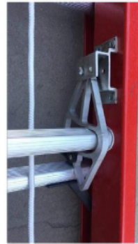
Gravity safety ladder locker gives fast easy action