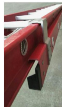
Guides at top of Base Station