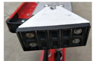
Durable Non-Slip Rubber Feet